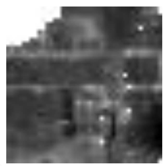
Figure 1: TRCIA