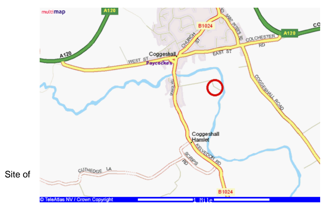
Coggeshall Abbey (circled)